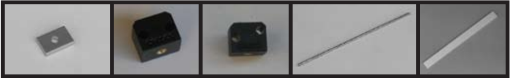
SPA-18 Spacer (Supplied separately)

If the Lockout Devices does not function correctly, as above, THEY SHALL NOT BE USED.