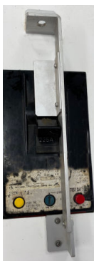
SALD-B-2 for illustration purposes only