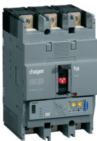
Suitable for Hager H250 breakers and similar