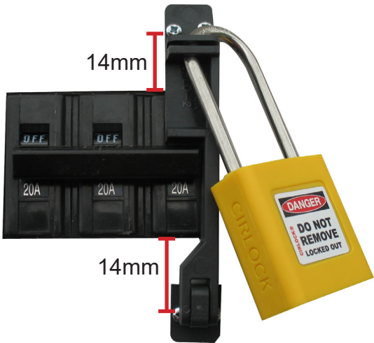
Mounting holes - 14mm from escutcheon cut out to centre of hole.

PLEASE NOTE: There are many variations available in both enclosures and circuit breakers. It is the users responsibility to ensure these mounting instructions are correct for your situation. This information should be used as a GUIDE ONLY